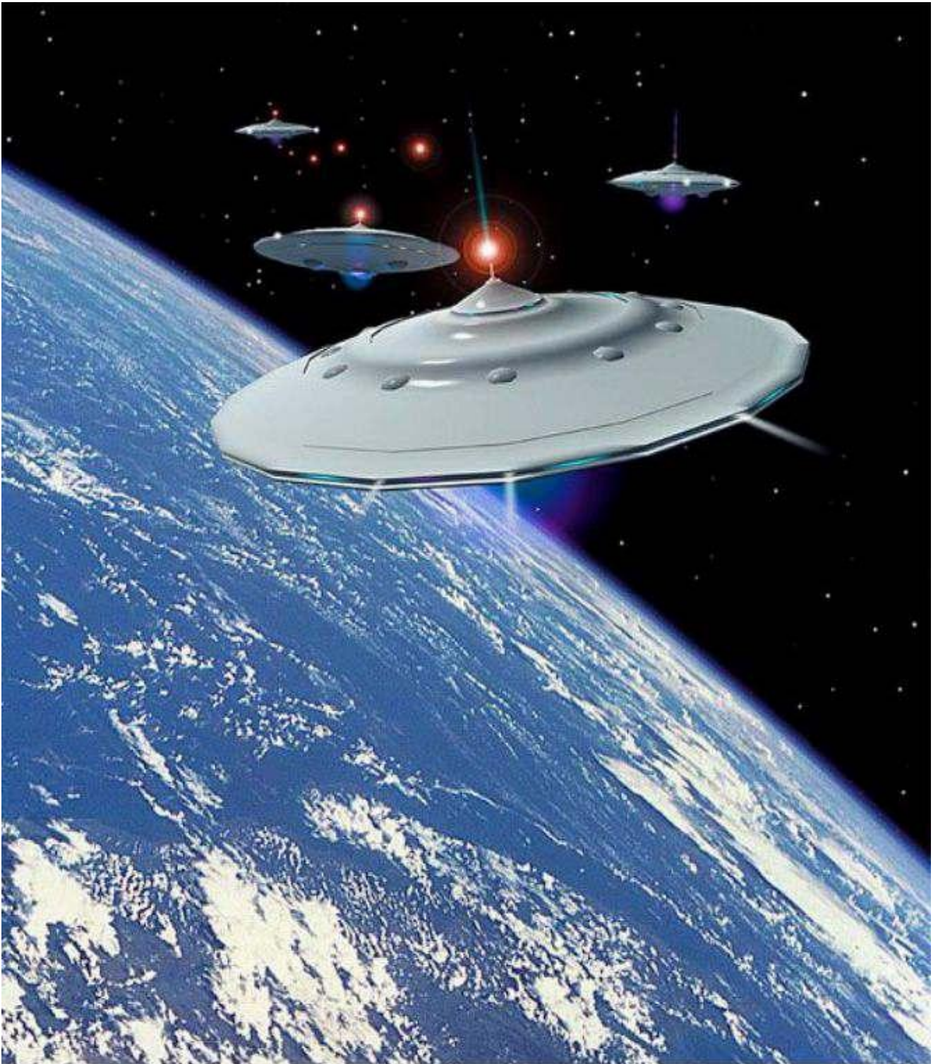
Small spaceships of the Metharia civilization ( see pic. 277 at www.cosmic-people.com )